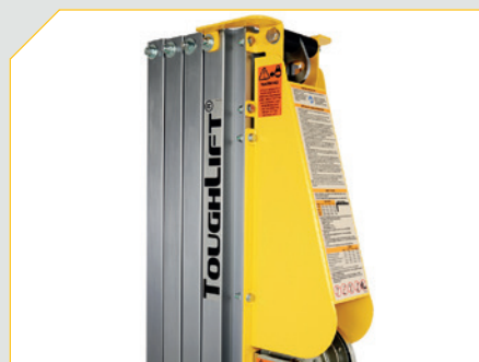
Cable guard with operational and safety decal.