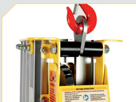
Hoisting and winching anchor.