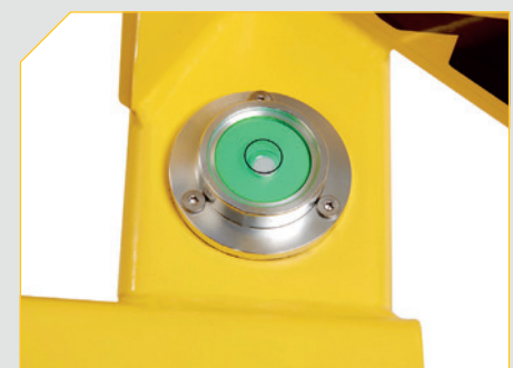
Spirit level to aid the operator to level the chassis.