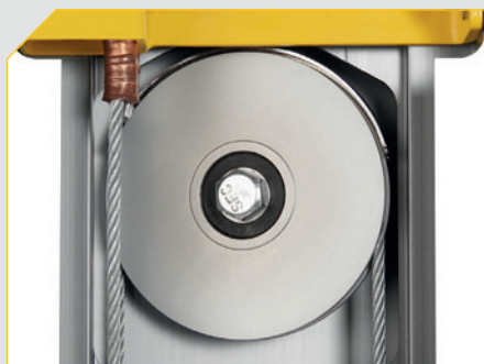
Hard wearing aluminium mast pulley wheels.