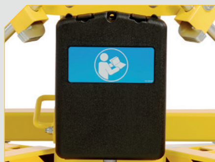
Robust waterproof document holder.