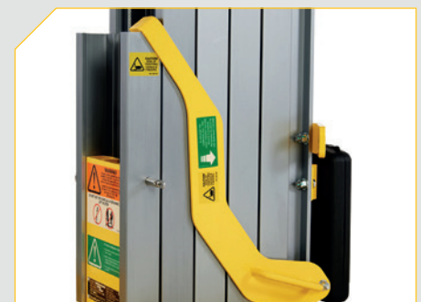
Carriage lock operates in all machine configurations.