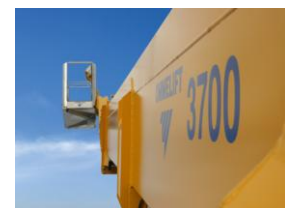
180° Basket turn