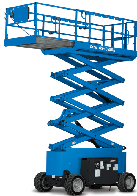
07/15 Part No. B127304UK