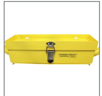
Toolbox containing charging cables and guardrail tools with tray mounted on guardrail