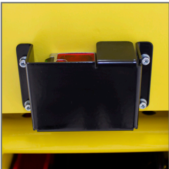
Overhead obstruction detection with alarm frequency increase and interlock