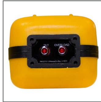
Tilt and overload warning lights, alarm, and interlocks