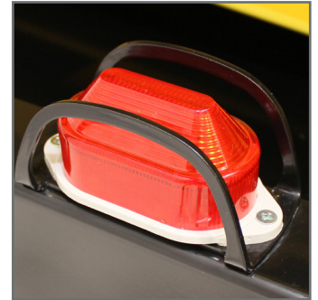
Warning lights and alarm on ascent/descent