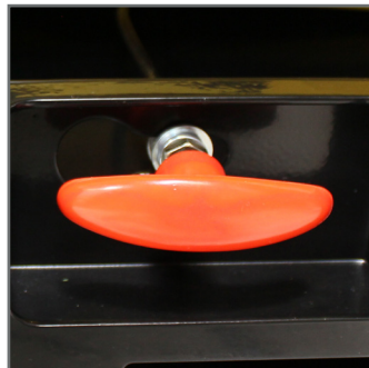
Easy access to single stage emergency descent