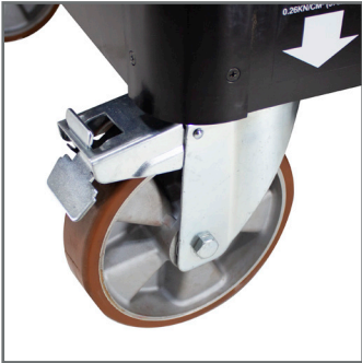
Easy to manoeuvre via heavy-duty castors with non-marking tyres

hospitals, schools, airports, shopping centres, retail outlets, transport environments, factories, offices and on construction sites.