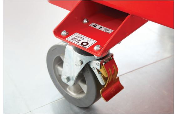
Heavy duty, non-marking castors