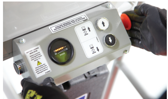
Simple, easy to operate push button controls