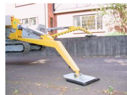
Easy set up