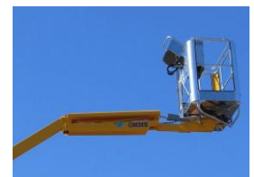
Fly jib (option)