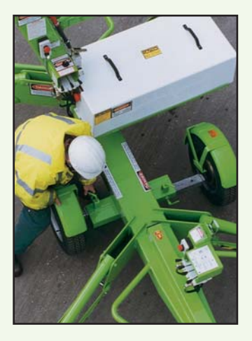
Retractable axles allow the Nifty 120 to pass through a 1.10m (3ft 6in) wide opening.

Due to a policy of continuing development and improvement, Niftylift reserves the right to change any specification without notice. Please confirm exact specification before ordering.