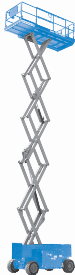
07/15 Part No. B127292UK