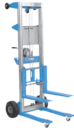
(1) Available aftermarket only