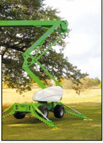
The extra manoeuvrability available from the 4 wheel steer option coupled with the special "Turf Tyres" make the SD210 ideal for working on sensitive surfaces such as grass.