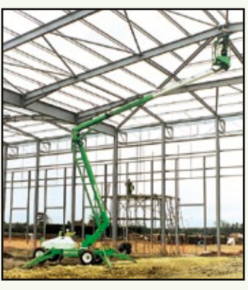
The SD170's outstanding reach makes it ideal for construction site work.