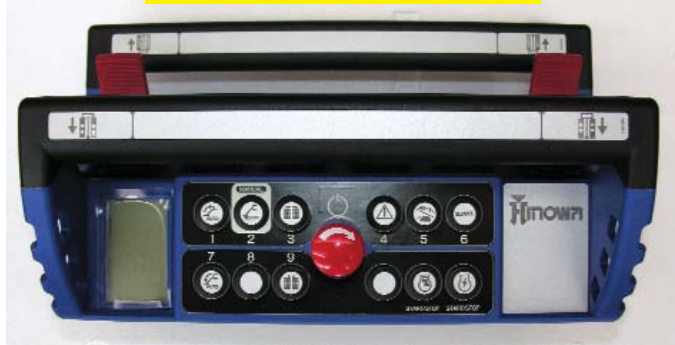
NEW RADIO CONTROL

The battery charger of the remote control is aboard machine in a protected place, the remote control is equipped with 2 batteries and preserves the possibility to be connected to the GoldLift through cable and to be used as wire-control.